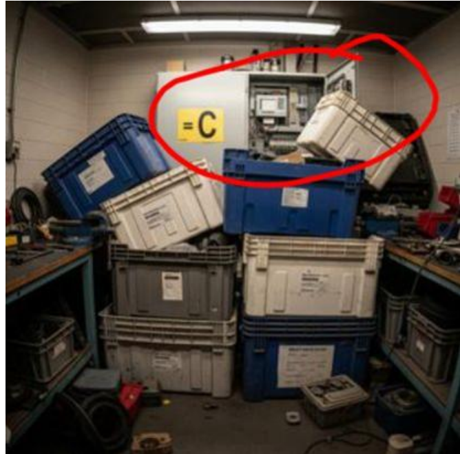
18 Jun 25 06:24 PM

Is sufficient access and working space (I.e. 36 inches) provided and NO maintained around electrical equipment allowed for safe operation and maintenance?